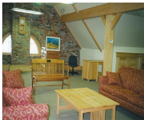
The “Library Loft” at Gouverneur

This award is given annually and consists of a plaque of recognition and $1000 check for the library. These are presented at the PLS membership meeting at the annual NYLA Conference. Any individual, library or board that is a member of NYLA may apply.