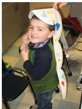
Dinosaur Day at a recent Flower Memorial Library Storytime. After reading dinosaur books and dancing to the "Dinosaur Stomp," the kids made these nifty Dino-Hats.