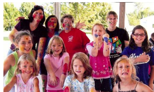
Summer Reading Kids in Turin displaying their "creativity" with face and body paint after meeting their reading goals for the summer.