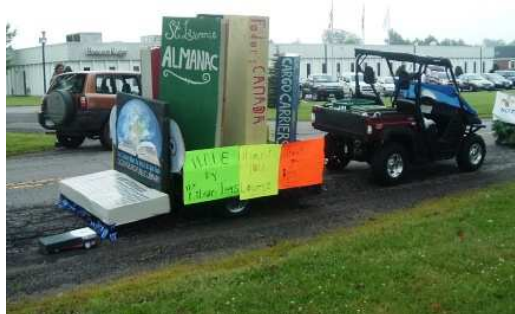
Ogdensburg Public Library entered a float for the first time in the Seaway Festival Parade and walked away with the Maple City Award.