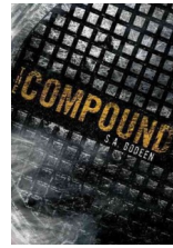
The Compound by S.A. Bodeen