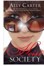
The Heist Society by Ally Carter