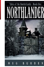
Northlander by Meg Burden