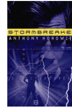
Stormbreaker by Anthony Horowitz

** Cover artwork may vary by edition. **