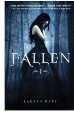
Fallen by Lauren Kate