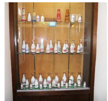
Antique milk bottle display