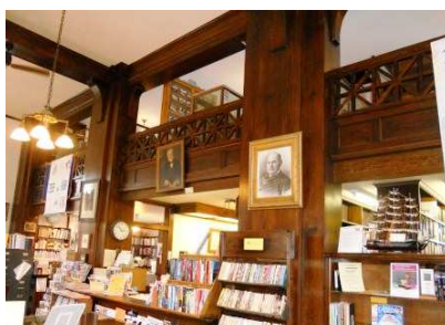
View from ground floor to upper level

While the library celebrates the rich history of the Theresa community, they strive to keep current with technology. Along with public access computers, the library offers free Wi-Fi and has recently signed a contract to begin the process of automating with the Sirsi circulation system. Congratulations to Theresa Free Library and best wishes for the next 100 years.