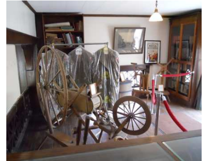
Items on display in museum include military uniforms and a loom pictured above

Theresa Free Library is situated right on Main Street in the Town of Theresa. While the library received its charter in 1902, it has been in the current building since 1910. The library was constructed for $7,500 with funds from the Carnegie Foundation. It is, therefore, considered to be an original Carnegie library.