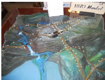
Model of Town of Theresa as it appeared in 1870

History is honored and memories kept alive at the Theresa Library. The upper level serves as a museum with numerous artifacts from Theresa's rich history. On the main level there is an interesting 1870 model of the town that attracts attention immediately upon entering the building. In the foyer is a display case that features exhibits of historical interest, such as the milk bottles pictured at right.