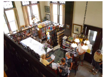
Looking down to the main level from upper floor museum

In the past ten years the library has been repainted and had new carpeting installed and drapery hung, but the library board has maintained the historical and architectural integrity of the building. All woodwork, light fixtures (some of which may be seen in these photos) and the majority of the furniture is original.