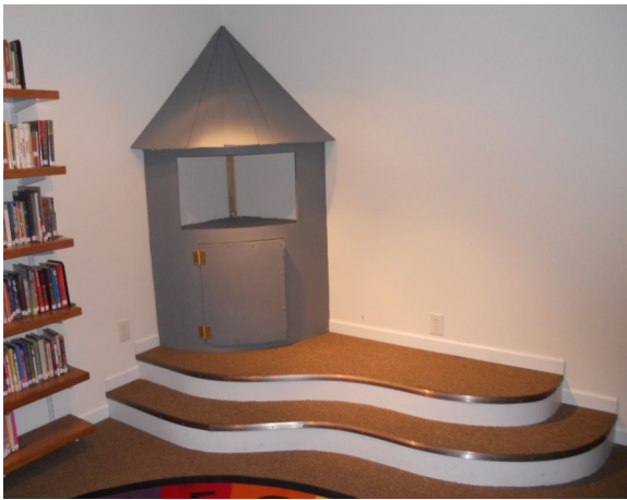
A stage and castle!