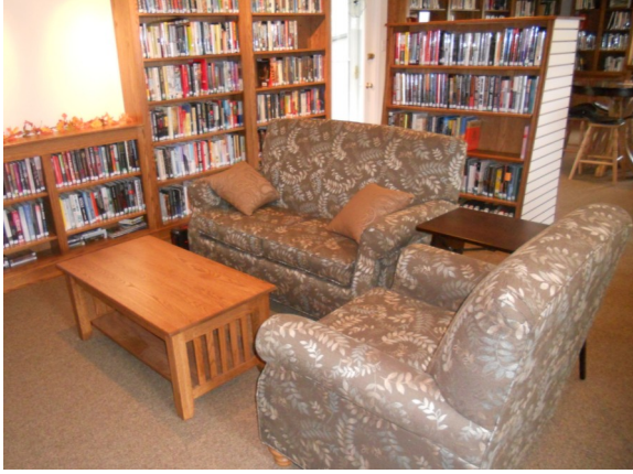
Cozy sitting area with fireplace