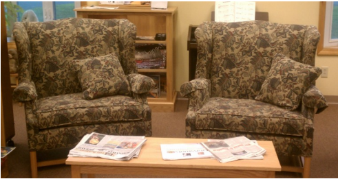
Cozy reading chairs