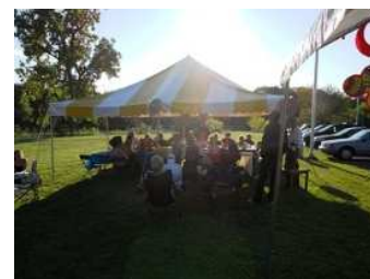
A new chapter begins