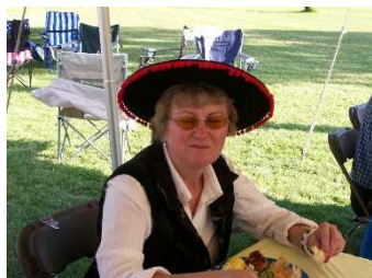
Guest of honor sporting a sombrero