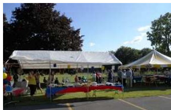
Festive set-up at NCLS