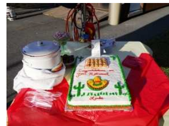
Cake complete with caramel calculator